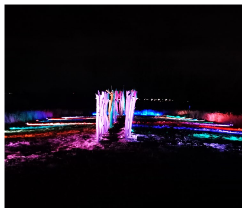
Riverlands Winter Illumination Walk