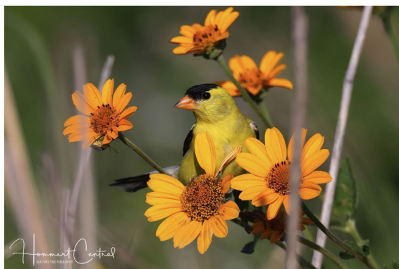
American Goldfinch at Riverlands.

15 interns prepared for further education and jobs of the future in conservation and related careers.