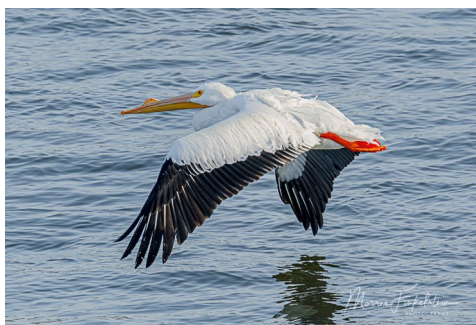
American White Pelican at Riverlands.