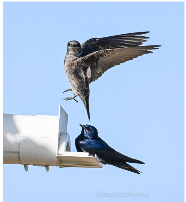
Purple Martins, Riverlands Nest Box Program. Madi Hawn