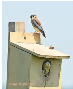
American Kestrels. Riverlands Nest Box Program.