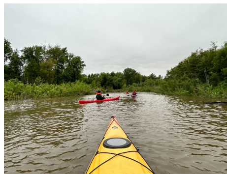
Sometimes we use kayaks and not our motorboat to get to point count sites during the Bottomland Forest Avian Survey.