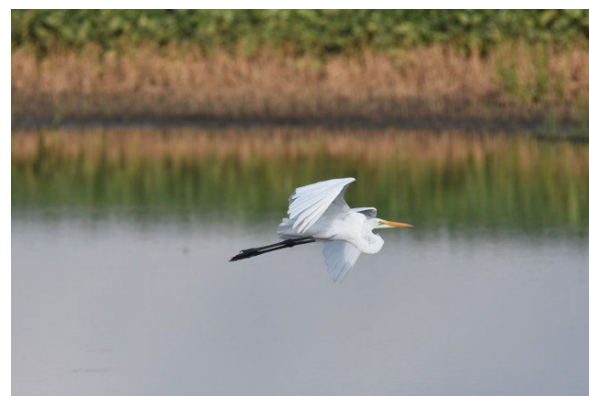
Great Egret at Riverlands.