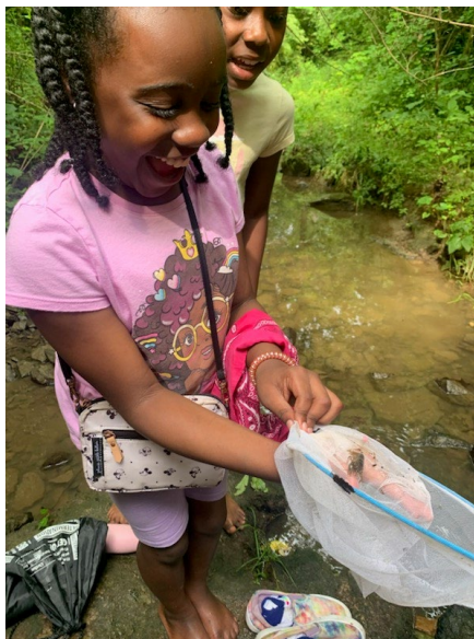
Pond Ecology at Little Creek Summer Camp.