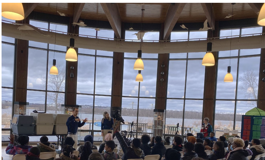
A Birds of Winter program with World Bird Sanctuary and Missouri Department of Conservation.