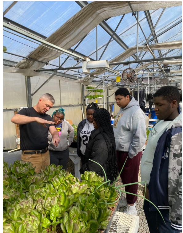
Conservation Leadership Interns learning about native plants and botany.