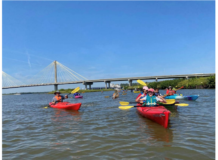
Kayaking w/ College School on the Mississippi River.