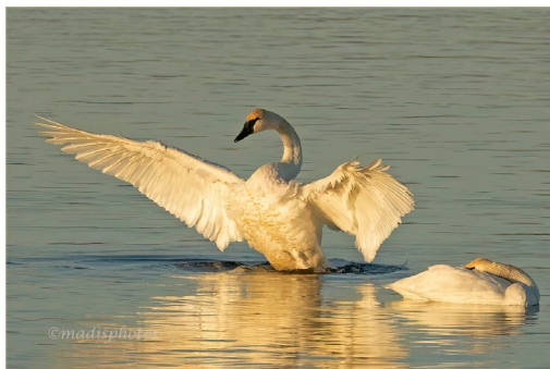
Trumpeter Swans at Riverlands.