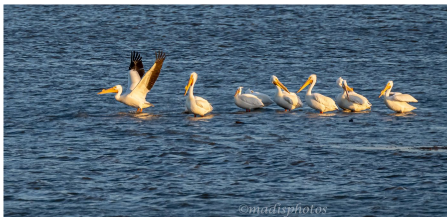
American Pelicans along the Great River Road near Riverlands.

Use this codicil in your estate planning and/or share it with your financial advisor then let us know so we can properly recognize you for your foresight and generosity.